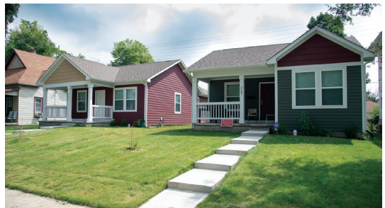
Nine Habitat homes were constructed on Graceland Ave. in 2014.